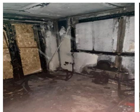
Fire Ignition Point Battery Hoover