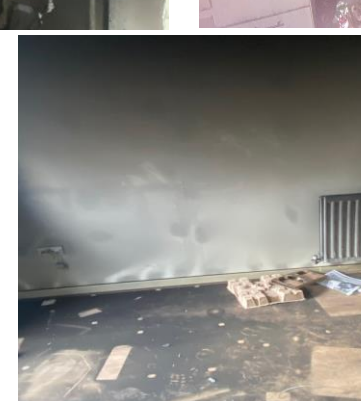
Kitchen Fire Door Removed Closer – Smoke Damage